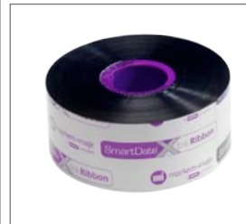
Choose between three ribbon types and a series of accessories according to your package type and needs.