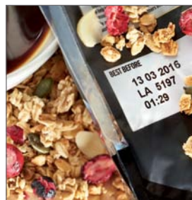
World leading service to guarantee uptime and quality coded products.

*Compared to other competitive models. **See conditions defined by Markem-Imaje.