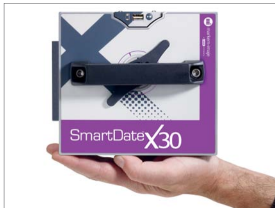
Compact in size for easy integration. SmartDate X30 is the smallest of SmartDate coders.

Gain direct access to one single point of contact for expert support on both your coder and ribbon.